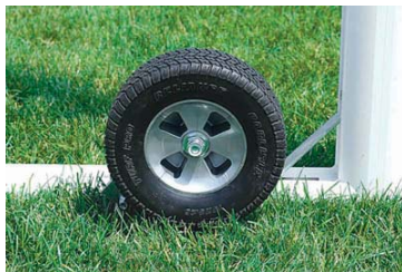
Wheels in up position